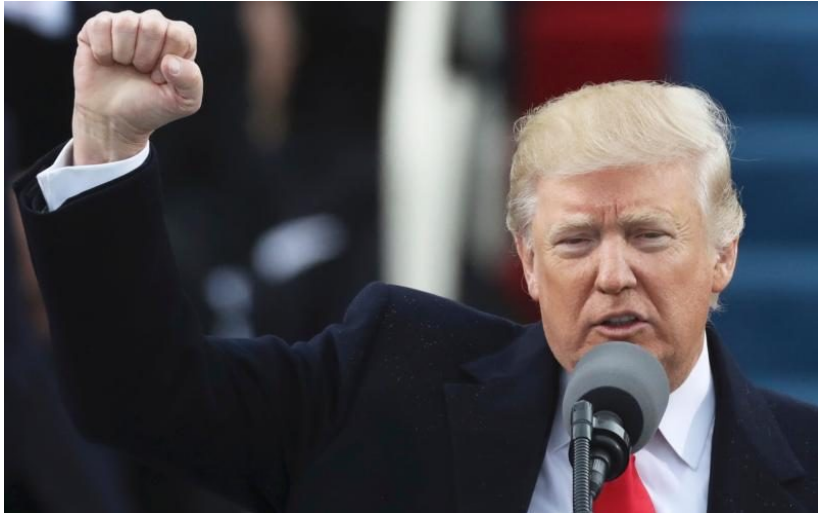
President Donald Trump speaks after his swearing-in as the country's 45th president

“I offer you my cordial good wishes and the assurance of my prayers that almighty God will