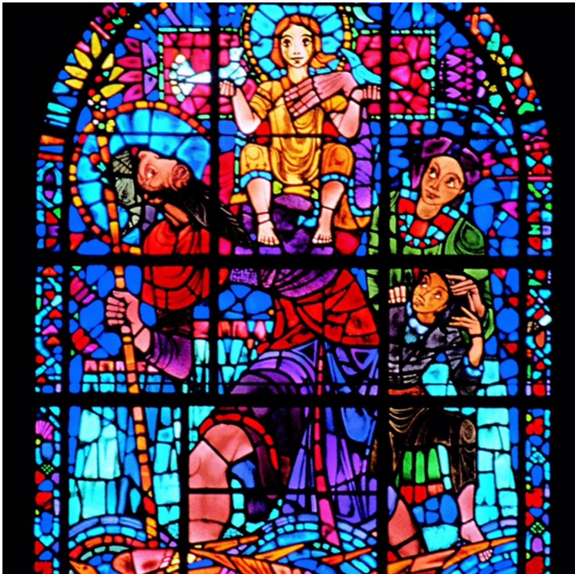
Image of the day - Bossanyi window, Canterbury Cathedral