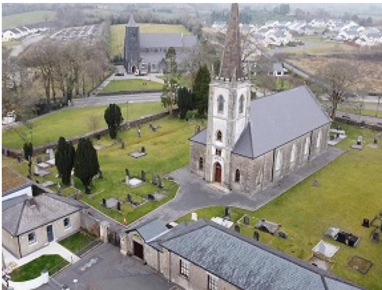
Sexton's House pictured at the bottom of photo

start going back to normal when the Covid 19 lockdowns, which have dragged on for over a year now, end.