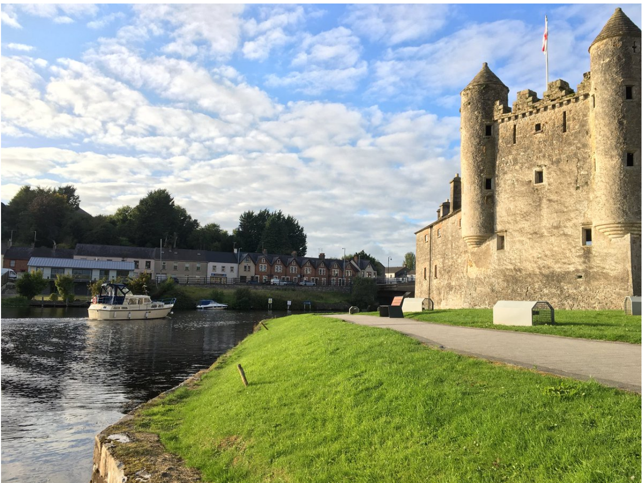
Image of the day Enniskillen