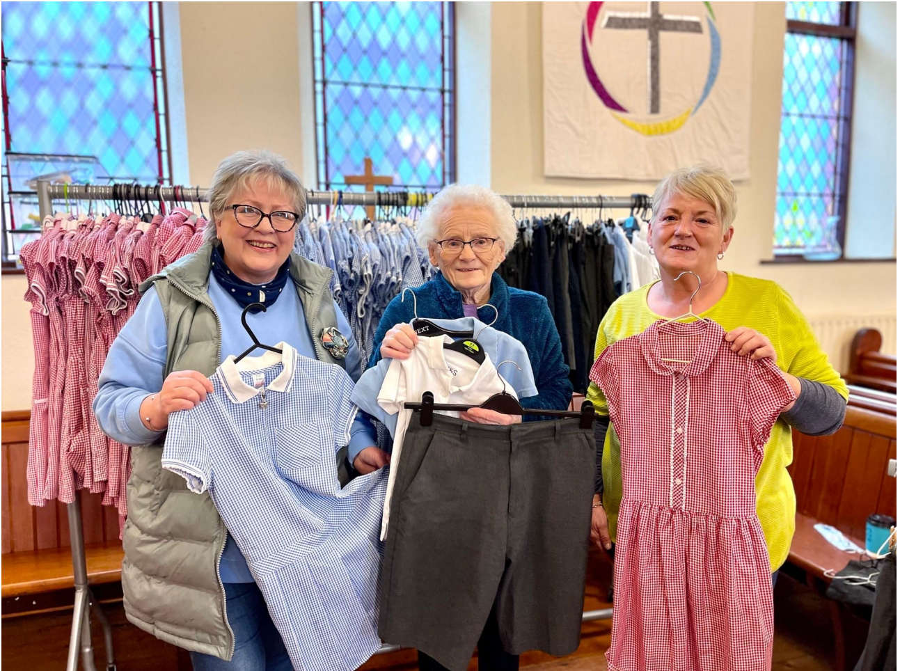
Image of the day – Ballyclare parishes pop-up school uniforms shop