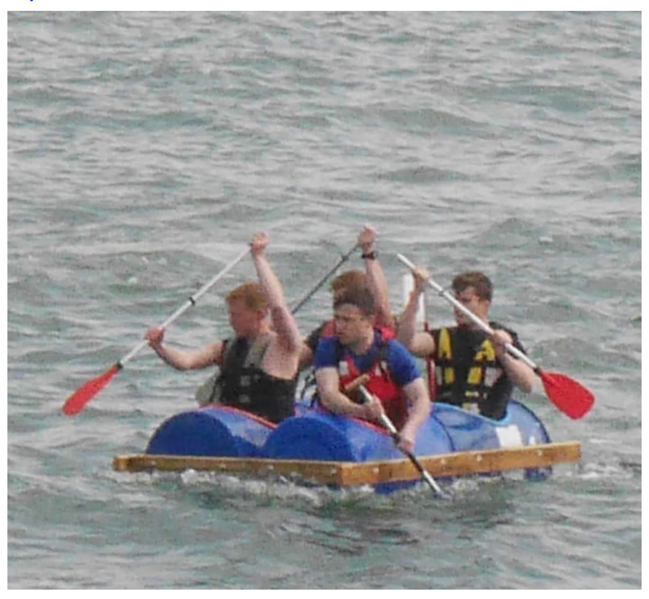
Clogher team raft races for Lifeboats

Magheracross Parish, Clogher, took part in the annual raft race at Portrush on Saturday past which is a major fund raiser for the RNLB - lifeboats.