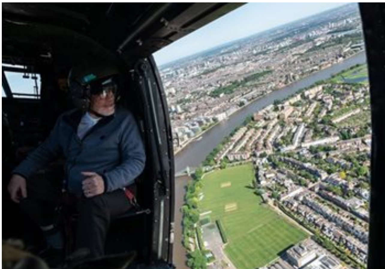
The Moderator over London in a RAF Puma helicopter Mk2 where you can see Hammersmith Bridge below

“I was delighted to be able to offer my encouragement and prayers for them personally and express the appreciation of the General Assembly as they fulfil God’s calling upon their lives.”