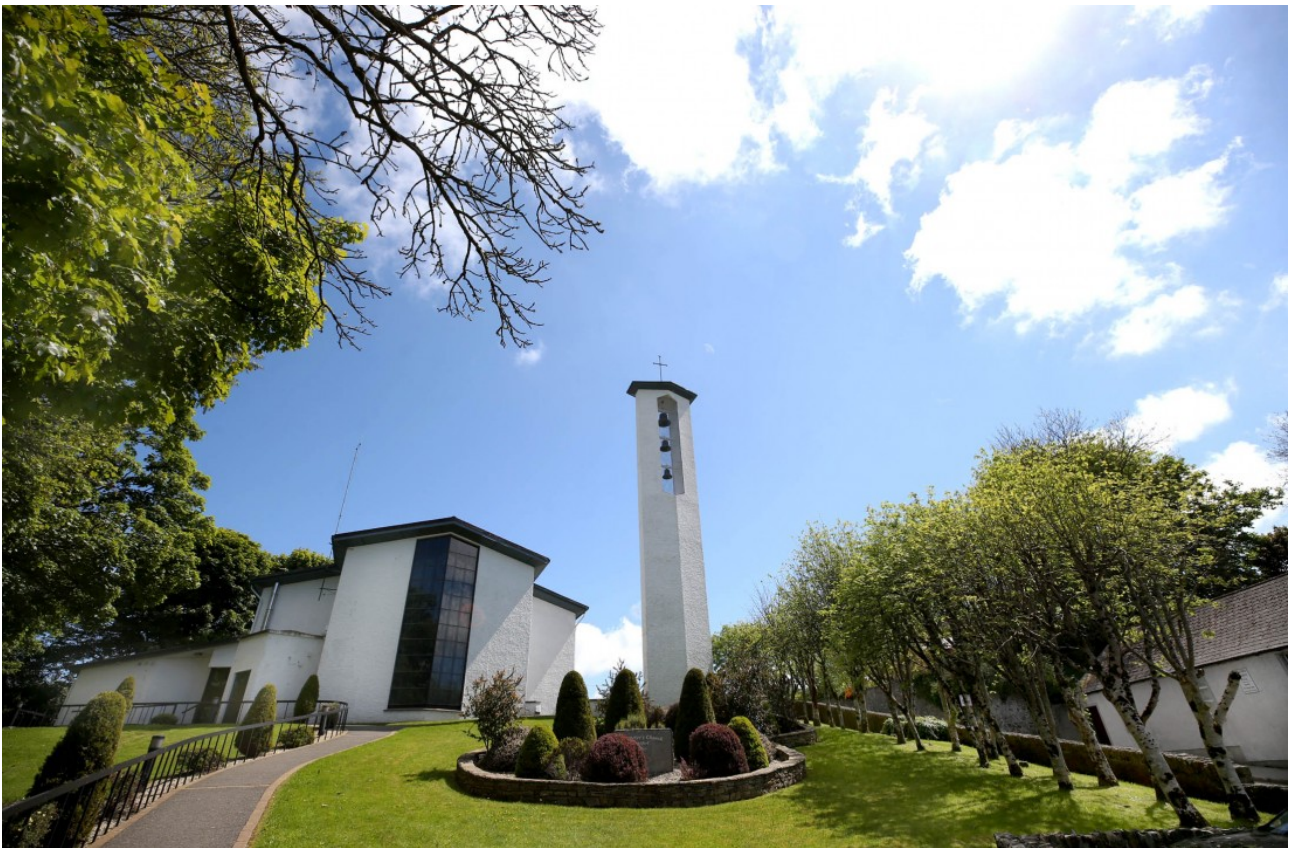
Image of the day - St Peter's Church in Milford