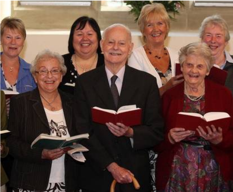
Former MP and leader of the Ulster Unionist Party Lord James Molyneaux pictured on his 90th birthday singing in choir at his church in Aldegrove

confirmed there and was a member of the select vestry."