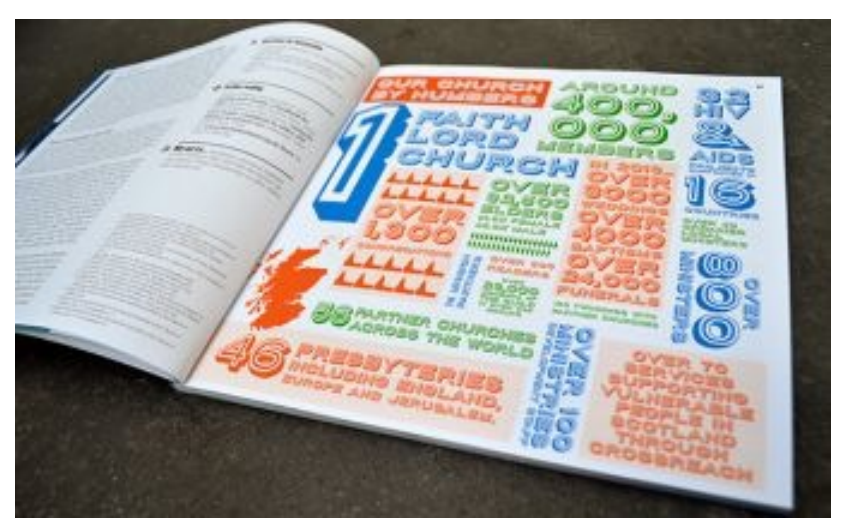
Learn is a potential game changer for the Church of Scotland

baseball shoes and stylish coffee houses, challenges stereotype notions of the Church.