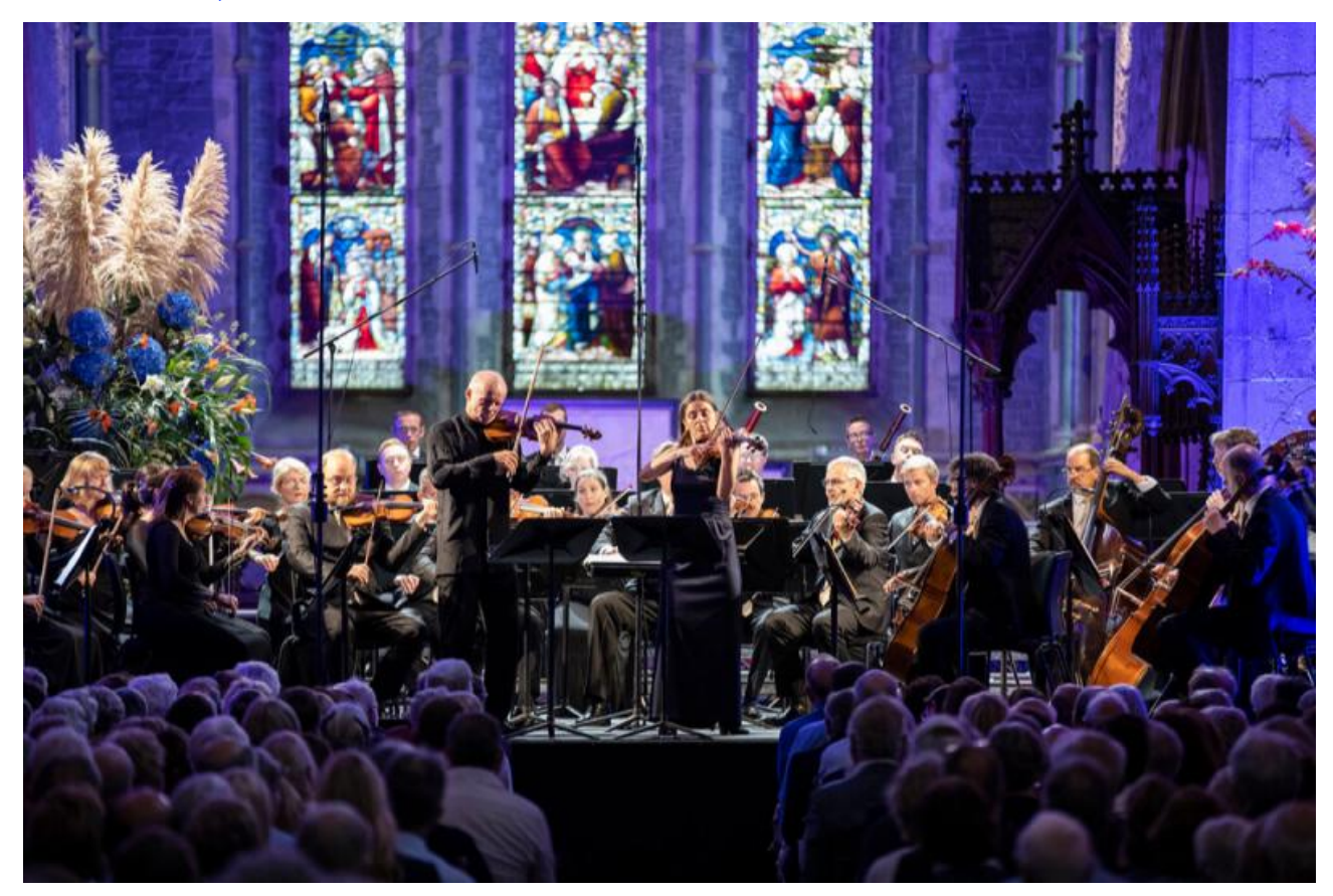
A Choral Christmas will take place at St Canice's Cathedral with The High Hopes Choir and The Lady Desart Choir on Friday December 16, at 7pm

They are now known as the Waterford High Hopes Choir and membership is not exclusively for homeless people, although they still have some of the original members, who now thankfully have accommodation.