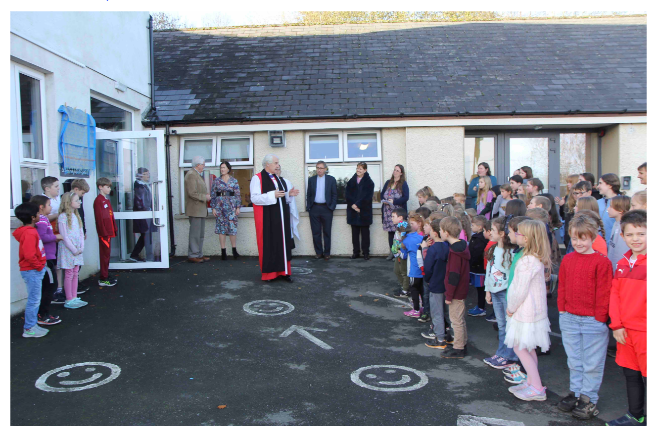
The Archbishop unveils a plaque to mark the occasion.

but throughout that they aimed to preserve the school's ethos. They aimed to provide a climate where all pupils could flourish and to educate pupils in line with the Christian principles of love and respect, she added.