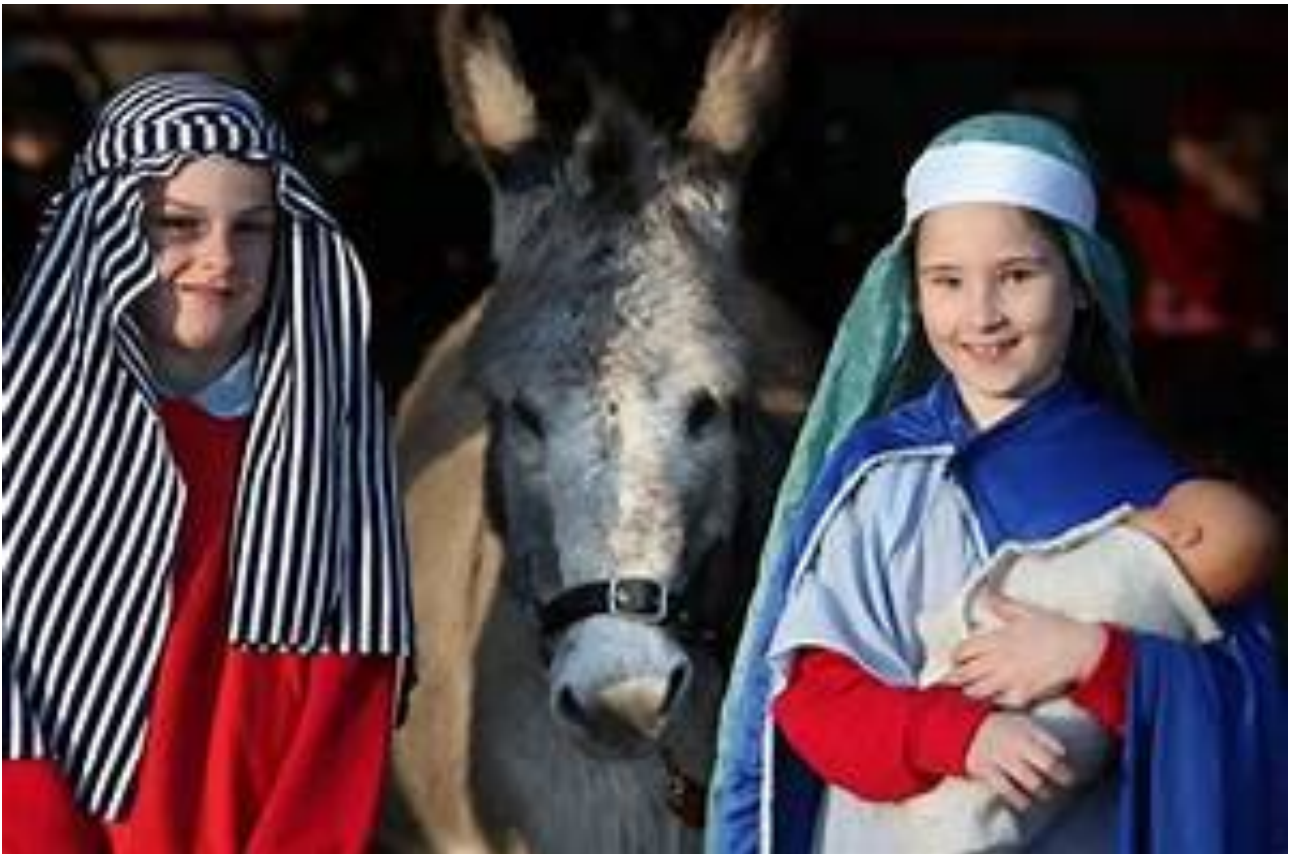
Image of the day – Nativity photo opportunity with Denver the donkey