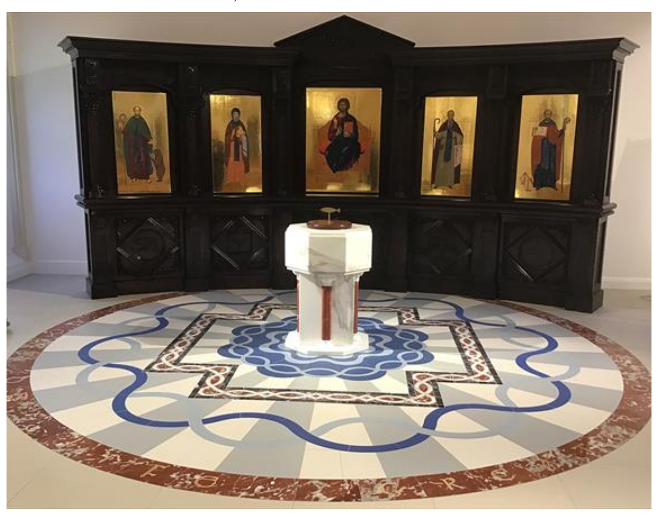
Events & Services November 5, 2022

Local schools will provide music and songs. Columbanus Festival 2022: A United Celebration Church Service. There is no need to book a place. Everyone is most welcome.