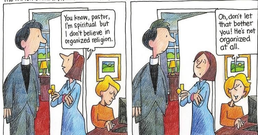
THE PARISH SECRETARY HELPS OUT THE RECTOR