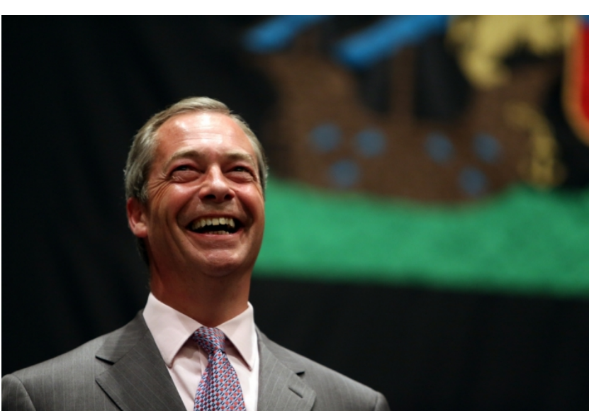
UK Independence Party leader Nigel Farage smiles as he hears the results during the European Parliamentary elections count at the Guildhall in Southampton, Hampshire.

vicardave):"blamin media coverage for@) these euro results is sticking fingers in