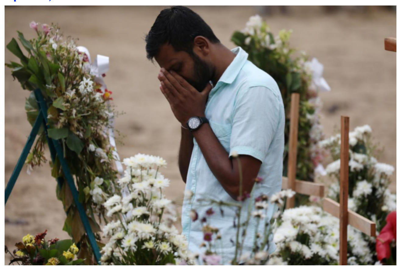
A man reacts during mass burials near St Sebastian Church in Negombo, Sri Lanka April 28, 2019

Cardinal Malcolm Ranjith, the archbishop of Colombo, delivered a homily before members of the clergy and the country's leaders in a small chapel at his Colombo residence - an extraordinary measure underlining the fear still gripping this nation of 21 million people.