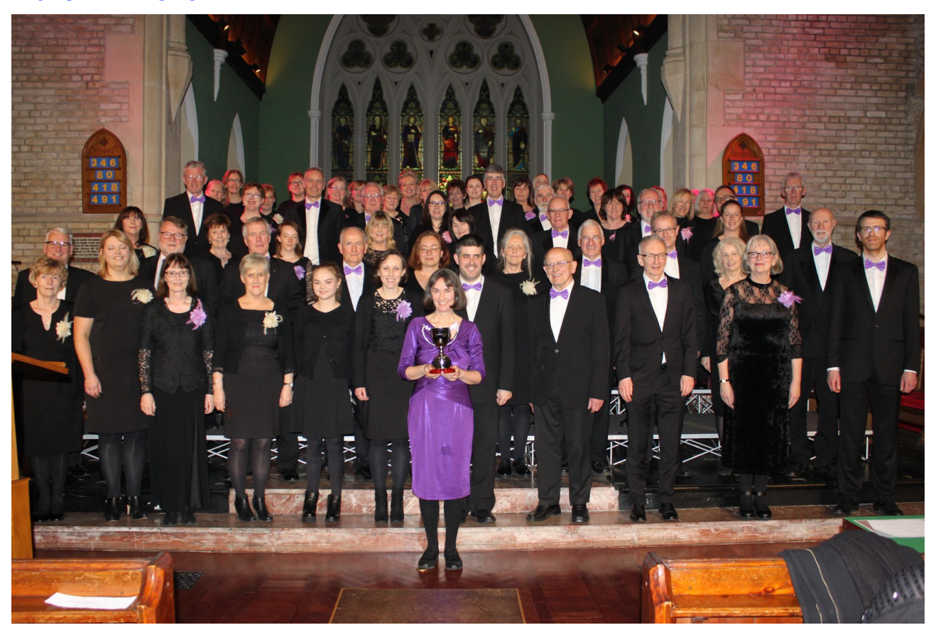
Dolce were the overall winners of the Clontarf Choral Competition for the second time.

3). With both junior and senior competitions, participating amateur choirs were drawn from Dublin, Meath, Wicklow and Tipperary.