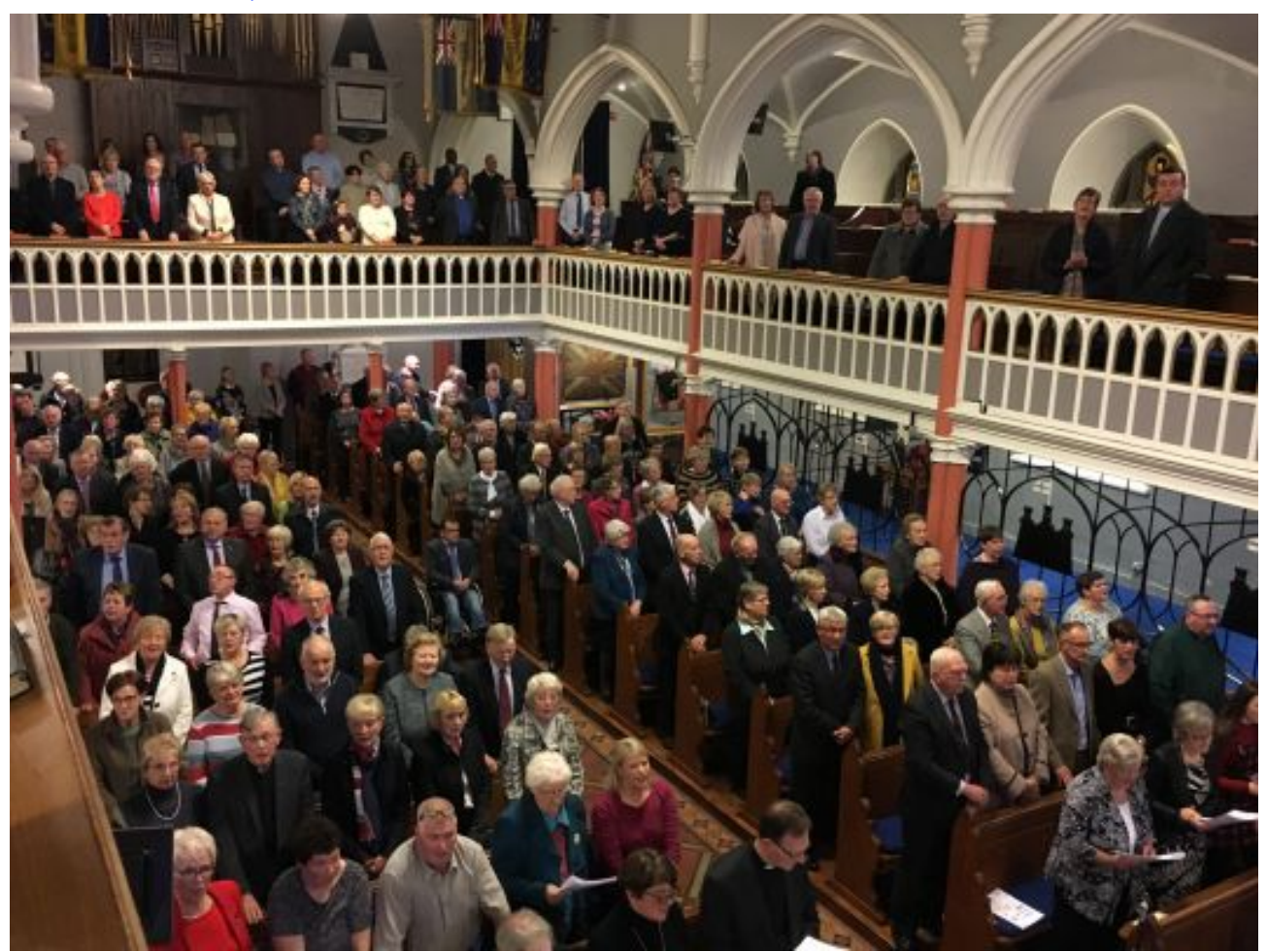
Part of the large congregation in St Macartin's Cathedral Enniskillen for the Big Sing

Choirs, soloists and a congregation drawn from across Clogher Diocese were in fine voice on Sunday evening, 18th November as they took part in the Clogher Diocesan Big Sing.