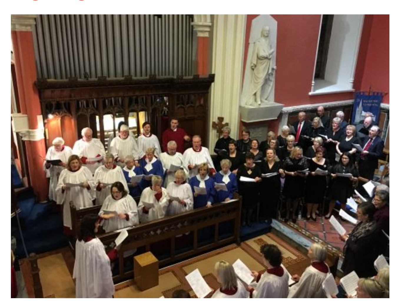
The combined choirs taking part in the Clogher Diocese Big Sing