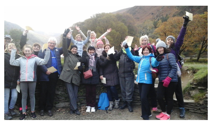
The group of people from St John's Church, Coolock, who raised funds for the Diocesan Housing Appeal on the Camino de Glendalough.

The appeal, which plans to raise €300,000 over three years to support a new housing project by the Irish Refugee Council with the Association of Missionaries and Religious in Ireland, was launched last month. Parishes and organisations throughout the dioceses are already coming up with ways to get involved and become part of the solution to the accommodation crisis.