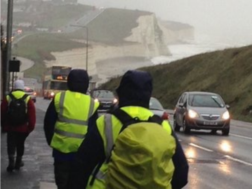
Church members on The Pilgrimage2Paris to lobby at the climate summit

successful outcome of the climate summit.