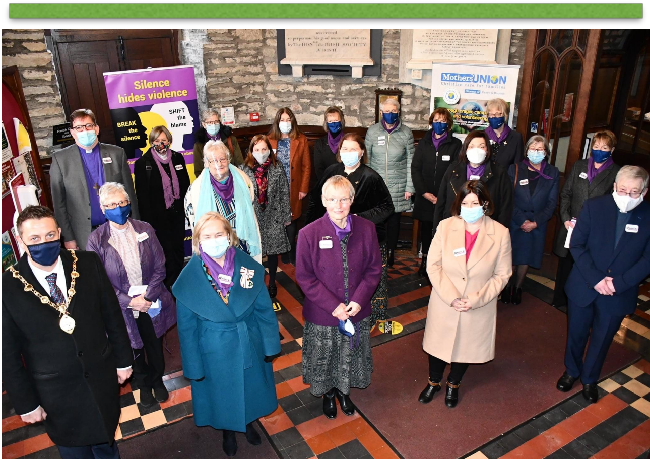
Image of the day - Mothers' Union continues 16 Days of Activism campaign