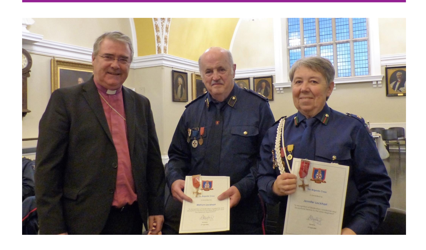
Image of the day – Church Brigade leaders exceptional service recognised