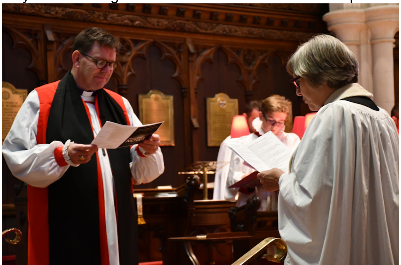
those who are physically, emotionally, economically and spiritually [poor] – and transformation into our world,

"Mothers' Union have this incredible history," the Bishop said, "an incredible present and an incredible future, in how they seek to bring transformation into the lives of the poor –