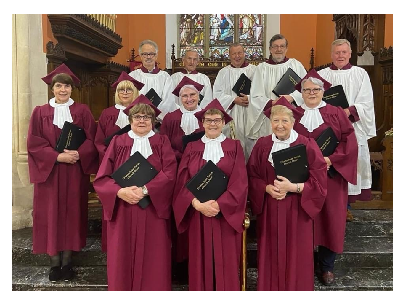
Limavady parish church choir