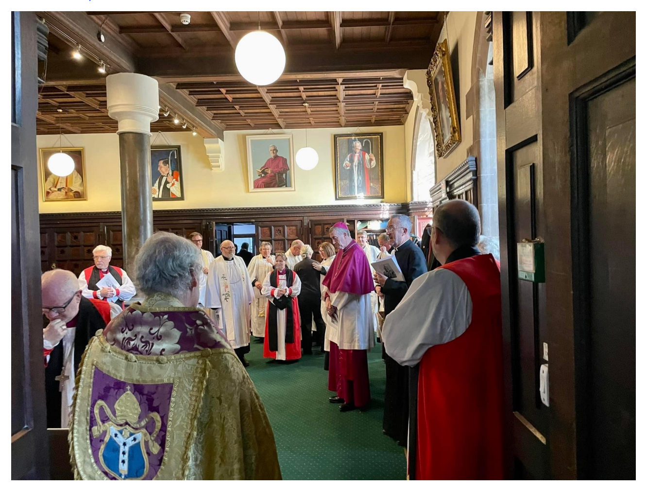
afternoon at Christ Church Cathedral, Dublin. Report to follow in tomorrow's CNI