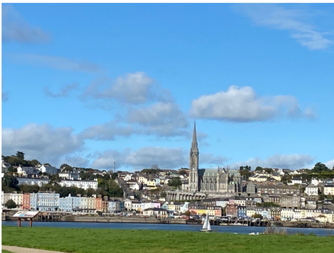
Image of the day - Cobh