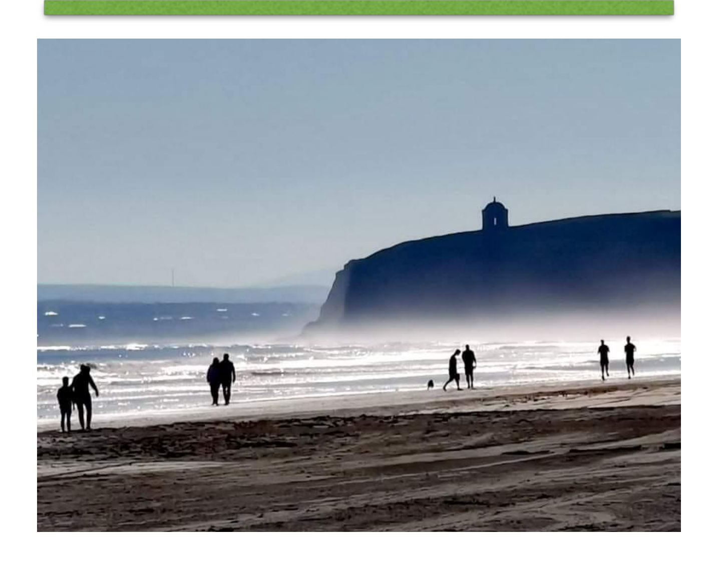
Image of the day Mussenden Temple and Downhill Strand Co. Londonderry