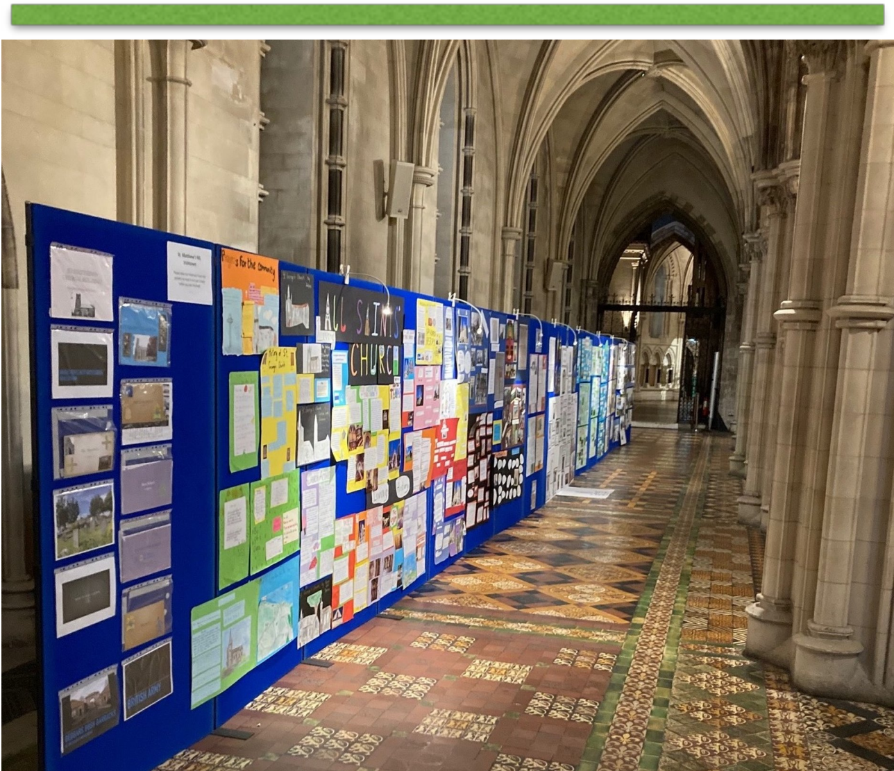
Image of the day - Living Faith Living History exhibition of primary school children's projects at Christ Church, Dublin