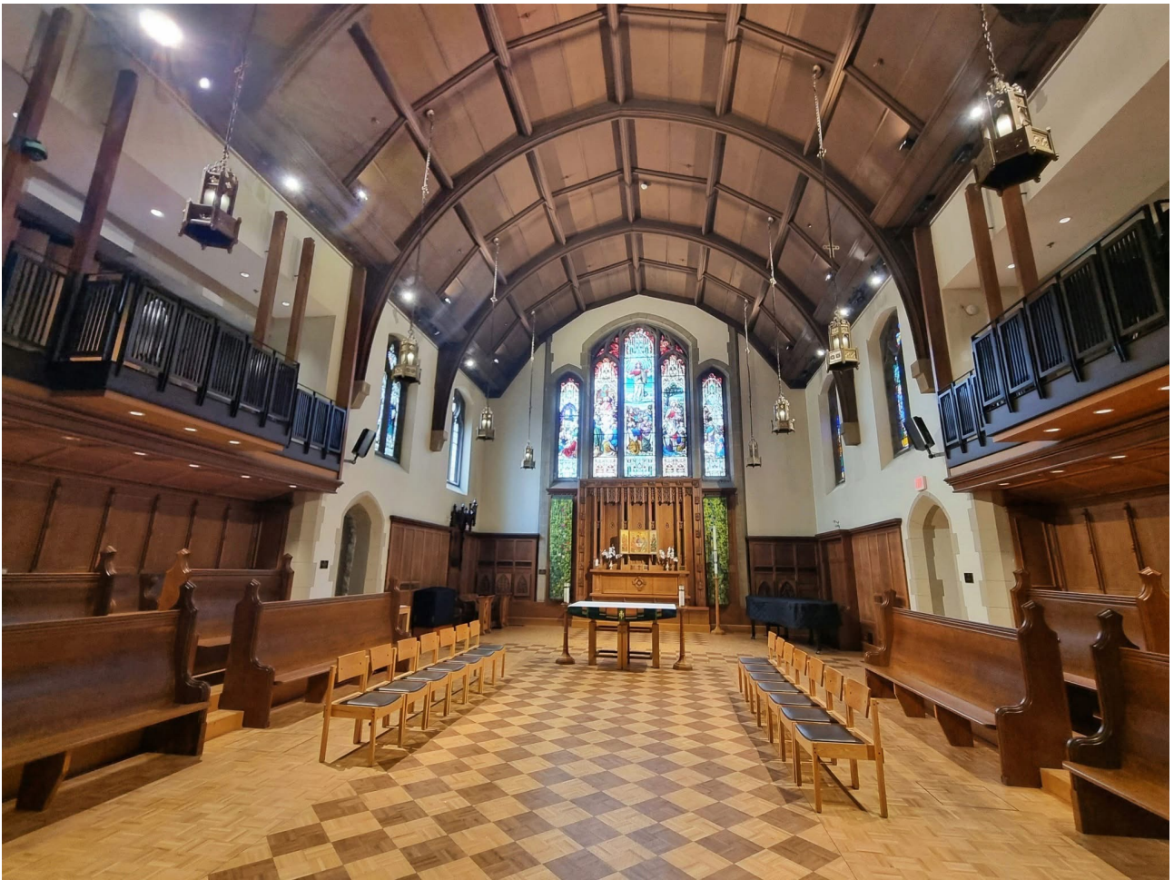
Image of the day Christ Church Cathedral Vancouver

The oldest building in downtown Vancouver, Christ Church Cathedral is the cathedral church of the Anglican Diocese of New Westminster.