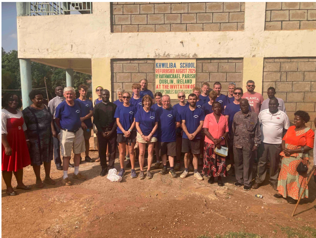
The Rathmichael team with the school board of management Khwiliba School.

What unfolded during that week of service in the Diocese of Maseno North was not only remarkable in practical terms, but also a testimony to the strength of global fellowship in the Anglican Communion and our common life in Christ.