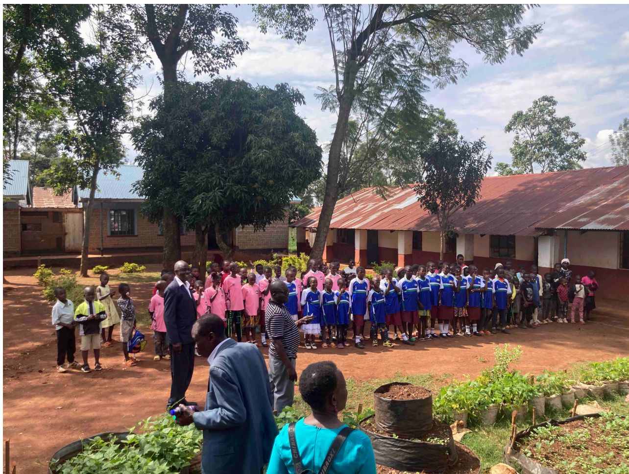
Children from Wandecche in their new school jerseys.

planned the trip carefully to make the most of the ‘time on the ground’ in Kenya, the group carried out an extraordinary programme of work at Kwiliba School.