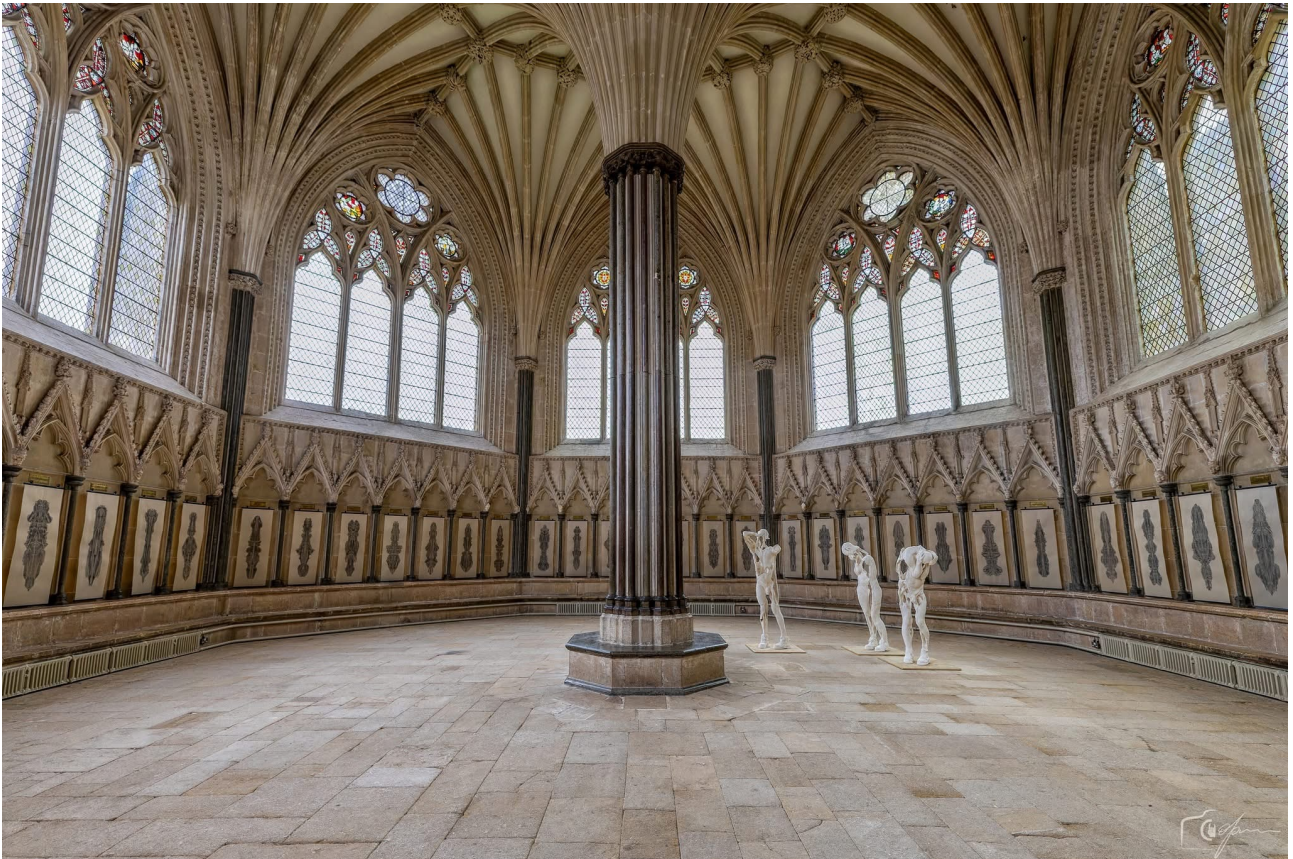
Wells Cathedral chapter house, Somerset

Upon entry, you immediately notice the light and open appearance of the chapter house. The central column of sixteen small Purbeck columns carries the vault, with thirty ribs (tierceron vaults) blowing out to the ceiling. The ribs are decorated with wooden buttons, vine vines, clove and some figures such as a 'green man' and a woman with long hair. In the Middle Ages, the space was darker due to stained glass windows and red-painted wooden elements of the stables.