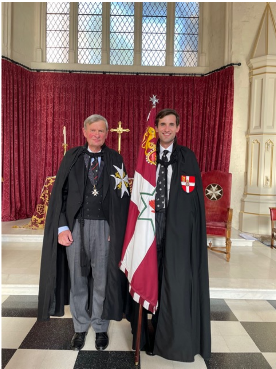
Image of the day - Knight of The Order of St John