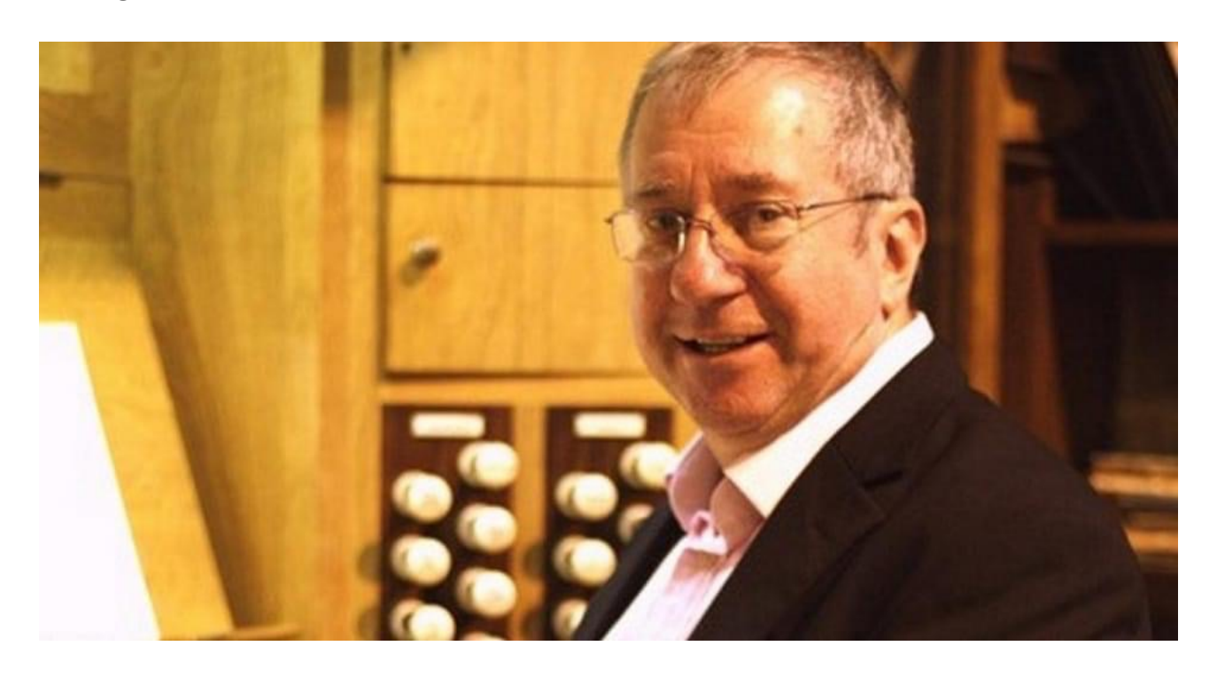
Free organ recital at St Thomas' Church, Belfast

To visit the centre, click on the following link: <a href="https://livingstoncentre.co.uk/product/tickets/">https://livingstoncentre.co.uk/product/tickets/</a>