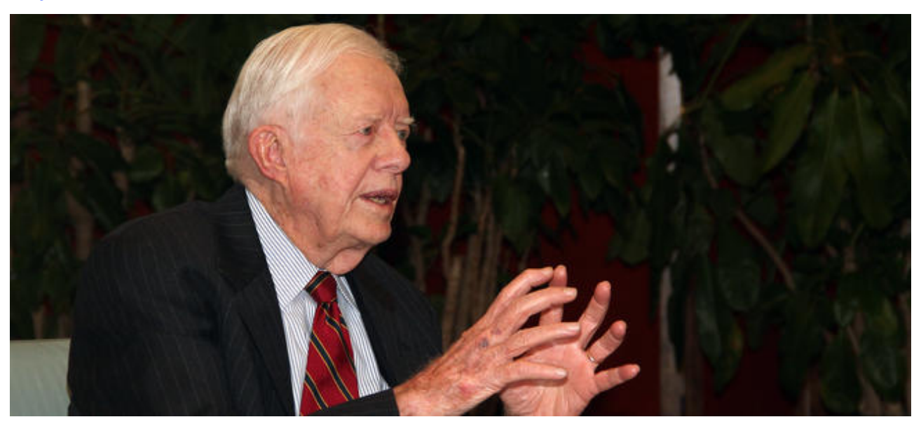
July 12, 2018

Church in Georgia - also spoke about his newly released book titled A Full Life: Reflections at Ninety.