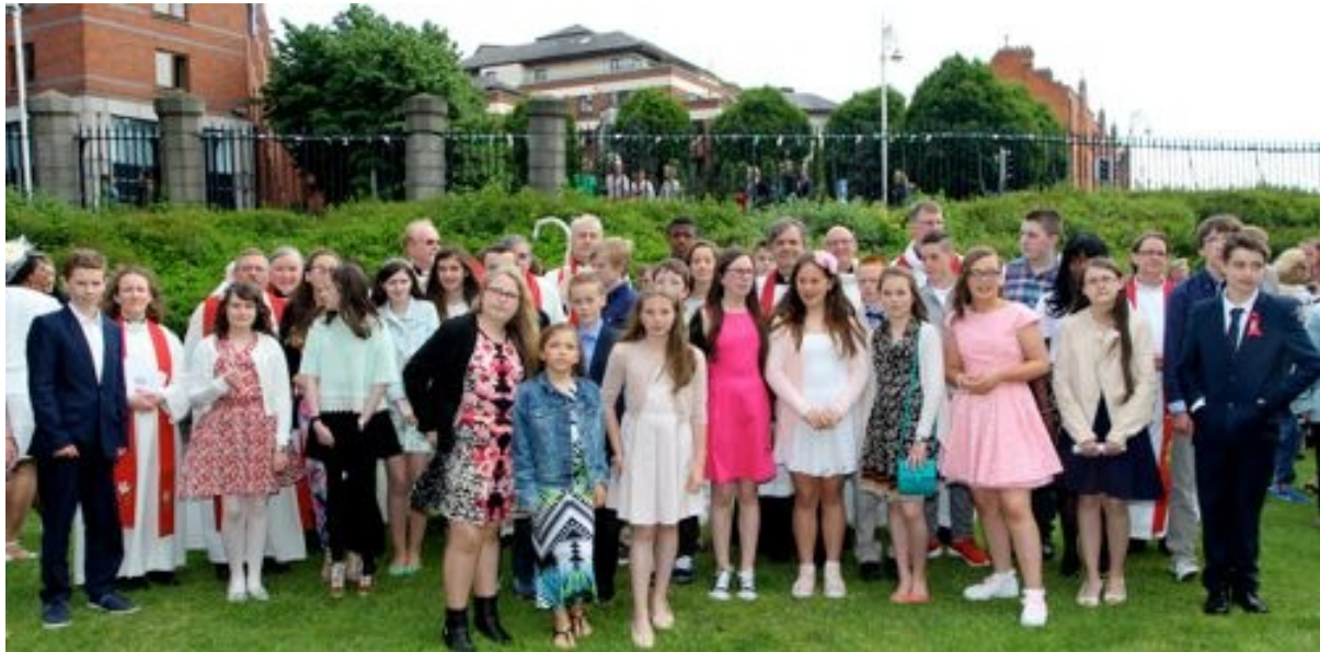
The candidates are pictured with the Archbishop and their Rectors outside Christ Church Cathedral