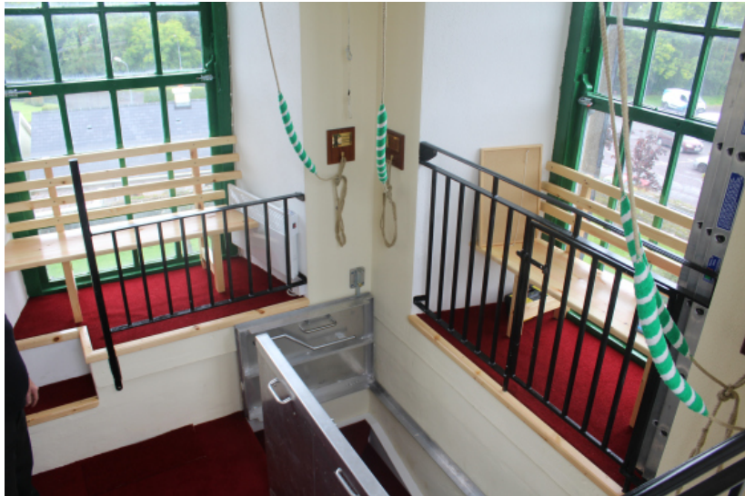
The finished ringing room in the tower of St. Mary's Church, Dunmanway.

of the Parish began to look at ways to commemorate Sam Maguire; the legendary sportsman and patriot who is buried in the parish churchyard in Dunmanway.